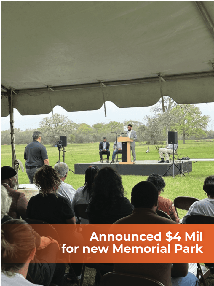
Announced $4 Mil for new Memorial Park