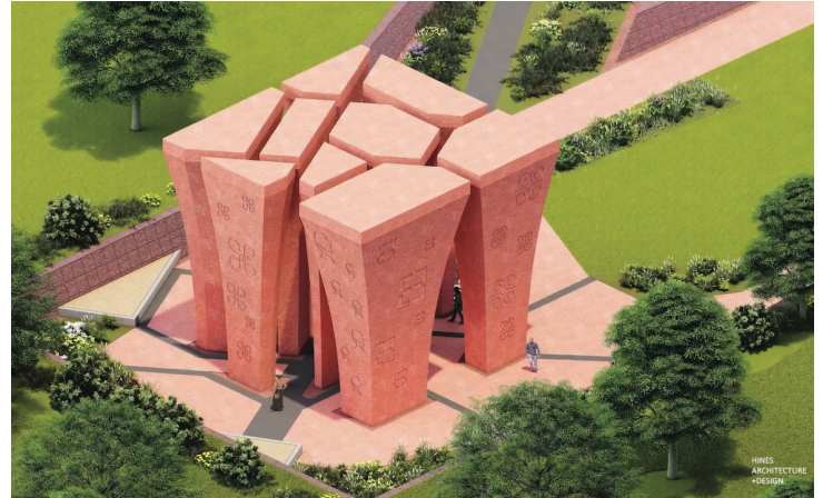
African American Memorial at Bates-Allen Park

This memorial, which will sit on 36 acres in the 236 acre Bates Allen Park, will commemorate the Black experience, not only in Fort Bend County, but in Texas.